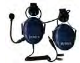
Intrinsically Safe Hamlet Heavy Duty Noise-cancelling Headset kit